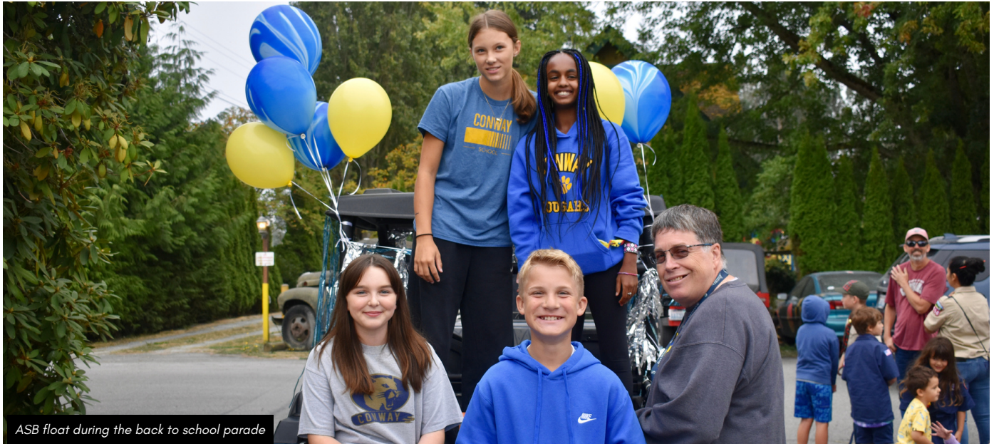
ASB float during the back to school parade

A PUBLICATION OF CONWAY SCHOOL DISTRICT #317