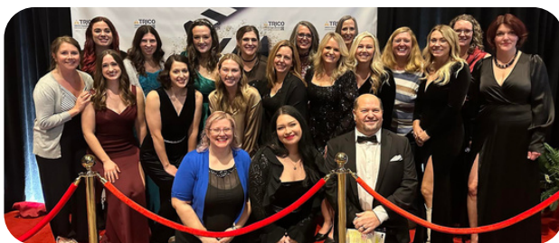
Conway School Staff Members pictured at the PTO Auction.

We had so many donors and volunteers who gave so much to help this event be successful. $79,427.92 will go to the PTO general fund to support Conway students and families in need, pay for PTO sponsored educational and enrichment events like Missoula Children's Theatre, educational field trips, after school activities, assemblies, classroom support, holiday baskets, teacher and staff appreciation and more! Thank you!