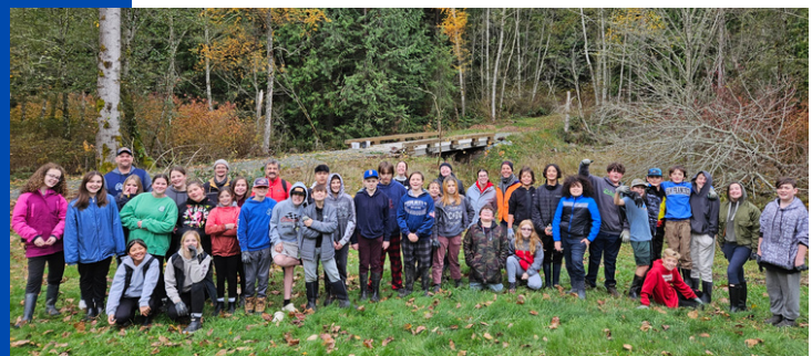
7th Graders planted trees at Starbird Creek.